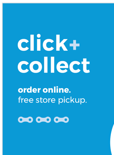
Email Main Graphic