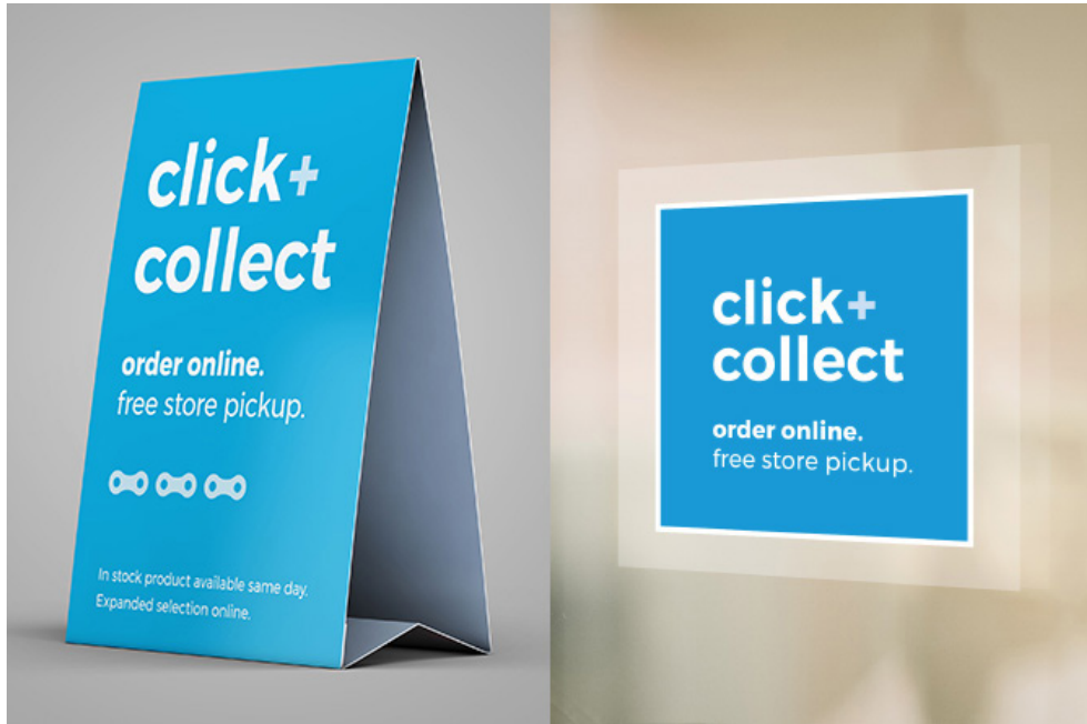
Table Tent and Window Cling (delivered to your mailbox)

Showcase the functionality and convenience that your SmartEtail website offers your local customers. Place table tents by your cash registers and the window cling on your door to let customers know that they can buy from your website and pick up in-store. Use the free homepage banner to alert customers as they browse your site.